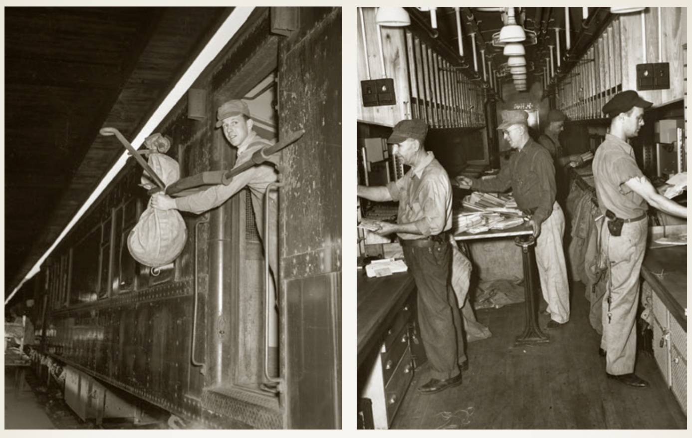
LEFT: Demonstration of how a clerk on a moving train retrieves a mail bag from a trackside mail crane, 1949. This Great Northern mail car is parked at St. Paul Union Depot. RIGHT: Four armed men, a typical crew for a branch line, working the mail; Chicago & Council Bluffs RPO on the Chicago, Burlington & Quincy Railroad, somewhere in Minnesota, 1948.

Sioux City RPO on the Chicago & North Western and the Minneapolis & Omaha RPO on the Chicago & Great Western routed mail down to the Union Pacific's and Southern Pacific's westbound RPOs in Nebraska. These took domestic mail onward to Denver and California and international mail to San Francisco for its Pacific Ocean crossing. The Minneapolis & Des Moines RPO on the Rock Island Railroad carried mail bound for southern states and Mexico as far south as Kansas City.