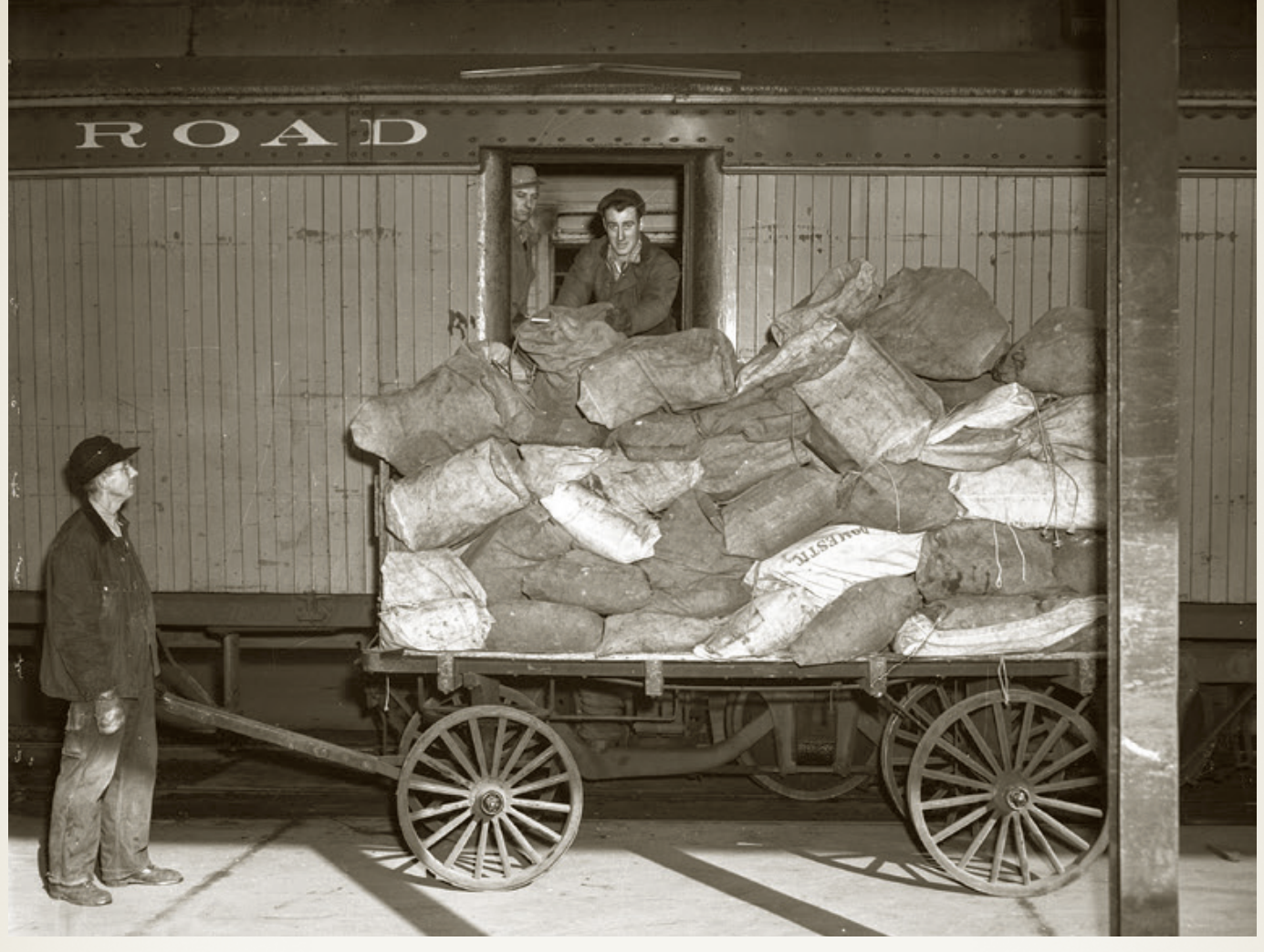
Clerks loading mail bags onto a Milwaukee Road RPO car, St. Paul Union Depot, 1949

order prefabricated homes from Sears Roebuck & Company; the building materials were shipped to them by freight car.<sup>31</sup>