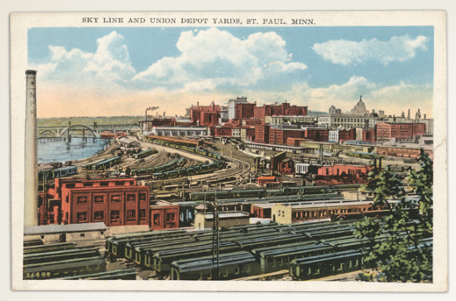
Busy rail yards at St. Paul's Union Depot, 1920s

in that order, the largest mail carriers in Minnesota in 1920. In 1926, at the height of RPO service in the state, St. Paul's Union Depot was the center of much activity: 149 trains moved in and out daily.<sup>14</sup> Most of these passenger trains had railway mail cars.